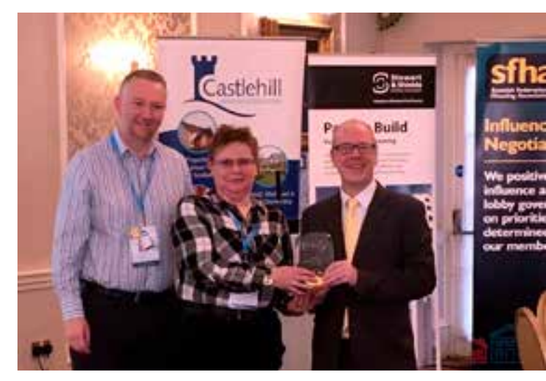
RIHAF Award Presentation

The coming year will bring its own new challenges, but with the continued support and dedication of our excellent team, we stand in good stead to continue delivering some of the best housing services around.